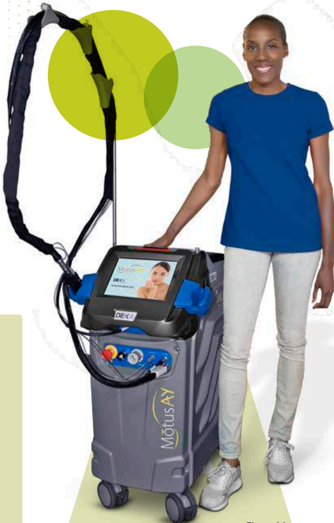
Fiona May Long Jump World Champion